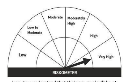
Investors understand that their principal will be at Very High risk

Benchmark Risk-o-meter (Price of silver (based on LBMA Silver daily spot fixing price))