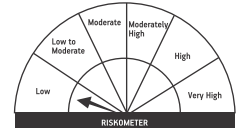
Investors understand that their principal will be at Low risk

*Investors should consult their financial advisers if in doubt whether the product is suitable for them.